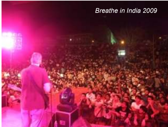
Breathe in India 2009

Web: http://www.thefloydsound.com Contact: Dave Gee T: +44 (0) 7716 764 551 e: breathe@thefloydsound.com