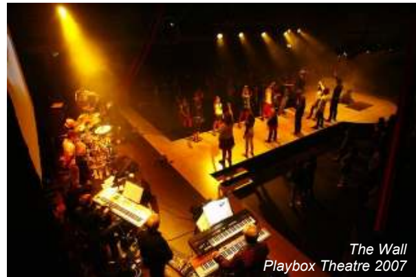
The Wall Playbox Theatre 2007